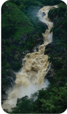
Dhabi Dhabhi Falls